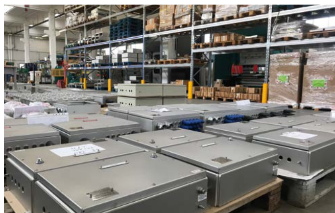
Factory dispatch area